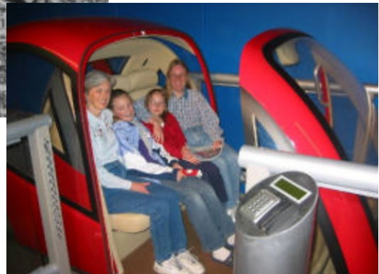
Family members enjoy a ride on prototype vehicle.