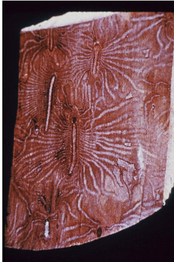
Elm bark beetle galleries in cambium layer of elm log. This sign indicates the beetles that act as vectors for DED were present in tree.

Forestry Division 403 East Center Street Rochester, MN 55904 507.328.2515 jryg@rochestermn.gov