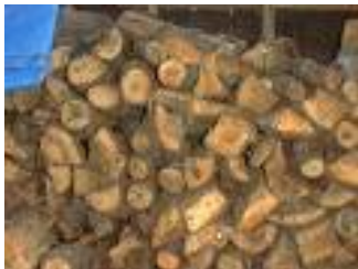
Bark intact elm firewood is prohibited within the City of Rochester

47.01 Nuisance declared. The prevention, control and abatement of Dutch elm disease and Oak wilt is necessary for the protection, preservation and conservation of public and private lands and the investment and benefit therein, and to protect and promote the general welfare of the public and this community. Therefore, the following conditions are hereby found and declared to be a public nuisance wherever they exist in the city.